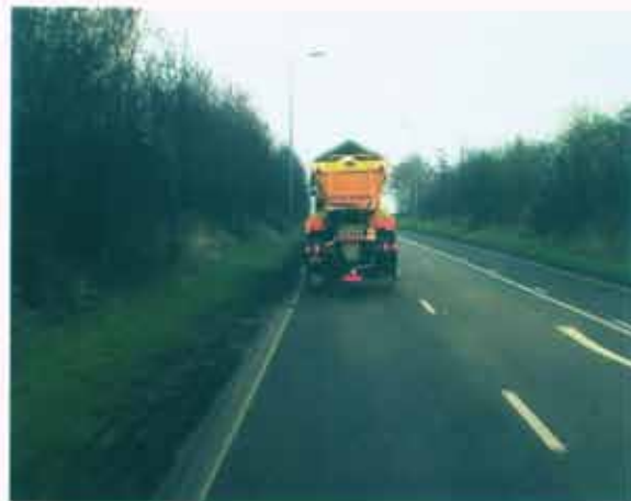
Thawrox stays where it's spread, reducing the amount of product needed to clear the roads.