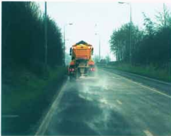
Traditional rock salt bounces around and flies off the road with wind and traffic movement.

Thanks to its efficiency and significant operational cost savings, Thawrox® is the future of deicing. Thawrox is produced by Compass Minerals, one of the largest basic producers of salt in the U.S. and an expert in the salt industry, so you can be sure you'll get exceptional customer service.